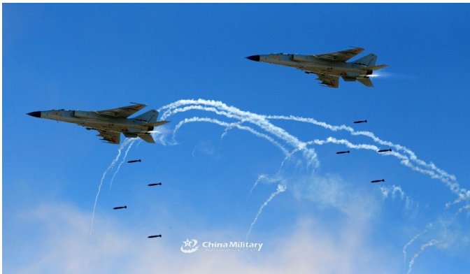
PLAF in Operational Training (china military online)