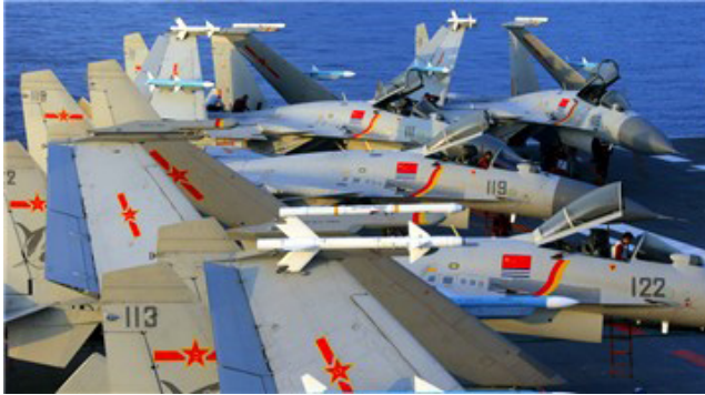
Aircraft Carrier Liaoning in Exercise

PLAN's notable sea exercises during the period, aimed at assimilation of training operationalisation of the modernisation schemes are listed as follows:-