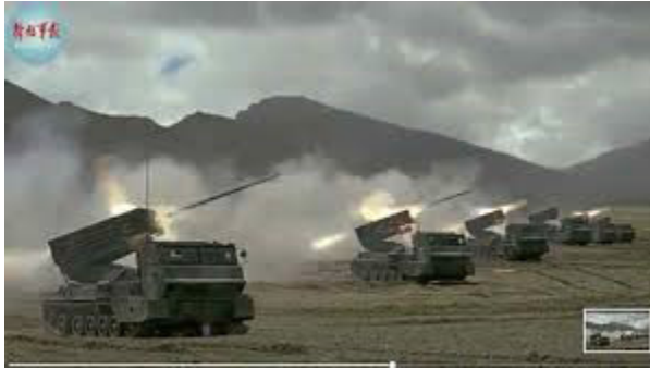
Fire Drills in Tibet ((freepresskashmir.news))

brigade level tactical exercises, and gradually began to locate some troops permanently on the high-altitude plateau.