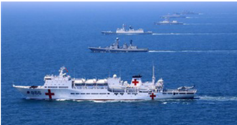
PLAN-ASEAN in Multi-national Exercise

Sailing through the Indian Ocean. During the period 2018-20, The PLAN continued with its practice of entering and sailing in the Indian Ocean and across the Straits of Malacca with the expressed intent of 'ensuring safety of international shipping'.