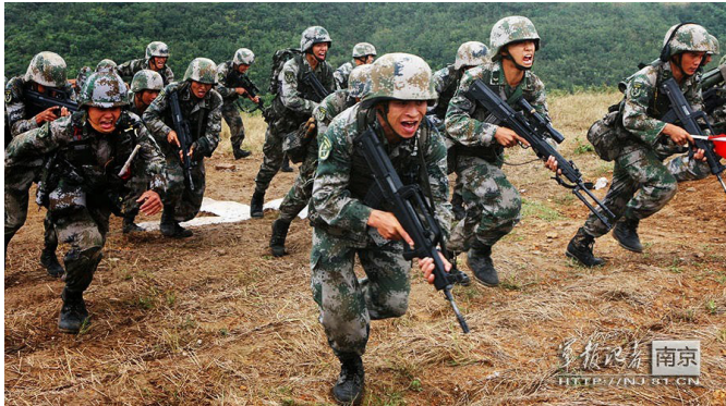
Infantry Training

The Infantry Battalion. In a highly significant development in the context of India and China's other land neighbours, the PLA has accelerated modernisation of its standard infantry battalions by converting these into an all-arm configuration. Thus while more or less retaining the battalion's troop strength, a number of combat support elements have been integrated at the battalion level itself. This is an immense improvement in battle capabilities of the PLA's basic unit of combat, which unless countered with compatible restructure and tactical procedures would force any adversary into serious disadvantages in the battlefield.