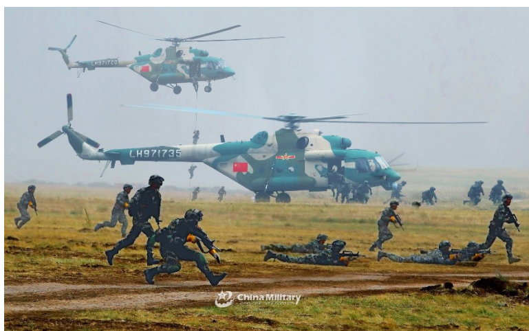
PLA in Training Exercise

Expansionist Push. Having accomplished, for the time being, the occupation of the first lot of key pivots in the two China Seas, shift of thrust to creation of disproportionately elaborate networks of border villages, troops' habitat and transportation infrastructure signifies China's intent, and capacity, to establish her iron grip over even remote and sparsely inhabited areas of Tibet. It also signifies a major westwards and southwards extension of PLA's operational reach. Listings of the PLA's operational build-up, preparations and tactical training schedules, with specific thrust on adaptation of the troops as well as modern weaponry and equipment to Plateau battle fields, reveal that the CMC has girdled up to push its expansionist agenda further across the Indo-Tibet Border in opportune moments.