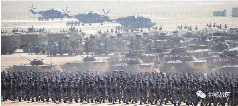
PLA Joint Training at the Zhurihe Central Combined Tactical Training Base, Inner Mongolia (Ministry of National Defence, PRC)

to new equipment through 'Bright Sword' Drills, and adapting to the new military tactics of 'quenching'.