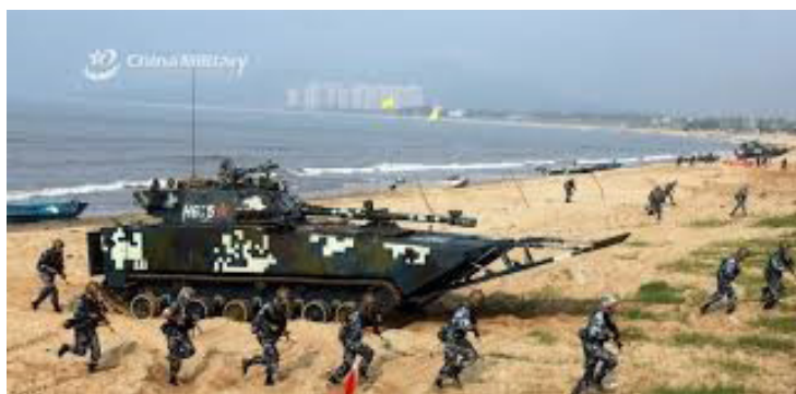
Joint Amphibious Exercise

During the period 2018–20, assimilation of PLA’s modernisation into the field formations has been exercised selectively up to the combined-arm battalion and brigade levels. But, conduct of division, group army or combined corps level collective training exercises have not been reported so far. Such step wise approach to operational training, starting from basic units of combat and gradually raising the level to larger battle formations is a standard practice in all militaries. That also indicates that for some years after 2020, the PLA’s battle formations would not have been well tested against their designated operational capabilities.