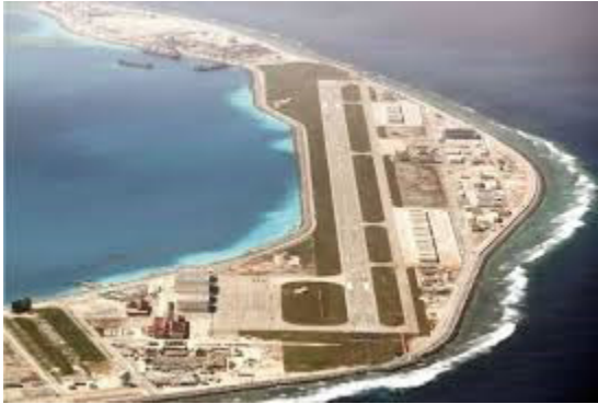
Occupation of Spartley Island/Fiery Cross Reef

of its Coast Guard to convert the encroachments into regular maritime outposts. The scheme is backed-up with menacing displays of naval and air cover.