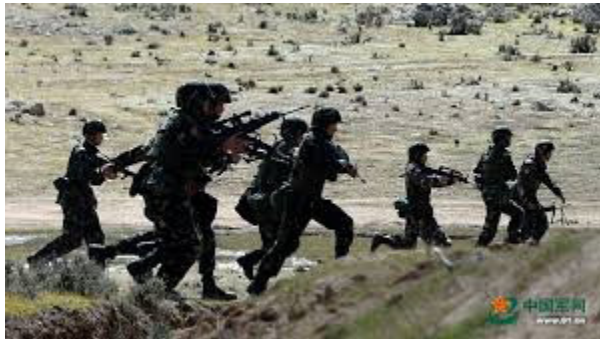
PLA Exercise on Tibetan High Altitude (china.org.cn)