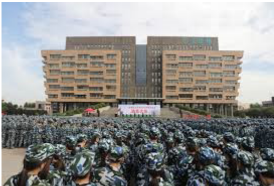
Zibo Military Training Institute (zbvc.edu.cn)

The PLA's intent during this period has been on harnessing the full range of tactical and technical capabilities of its modern military hardware through rigorous training schedules at individual and collective levels. Notably, much emphasis has been laid on innovative use of the hardware characteristics. Thus, following due theoretical and simulation training exercises during the preceding years, selected modernised and restructured units and formations have been put through their paces in various field exercises conducted on ground, sea and air ranges from June-July 2018 onwards.