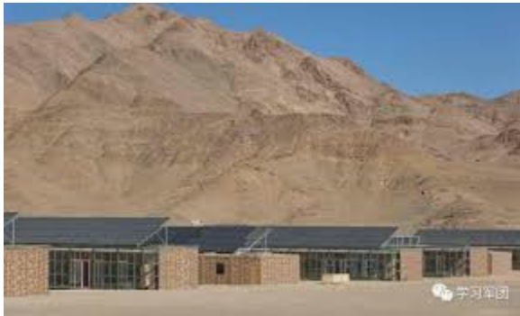
PLA Troops' Shelters in Tibet (en.people.cn)