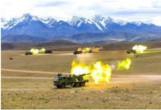
PLA Manoeuvre Training on Tibetan Plateau

The first schedule of high-altitude plateau specific operational training was organised in 2016. Subsequently, the Western Theatre Command's Army component has been organising unit and combined combat group training exercises, which are observed, studied and analysed at all the five-levels of military hierarchy. Notably, the training curricula and simulations have been unequivocally aimed at capture of tactical heights along and across the LAC.