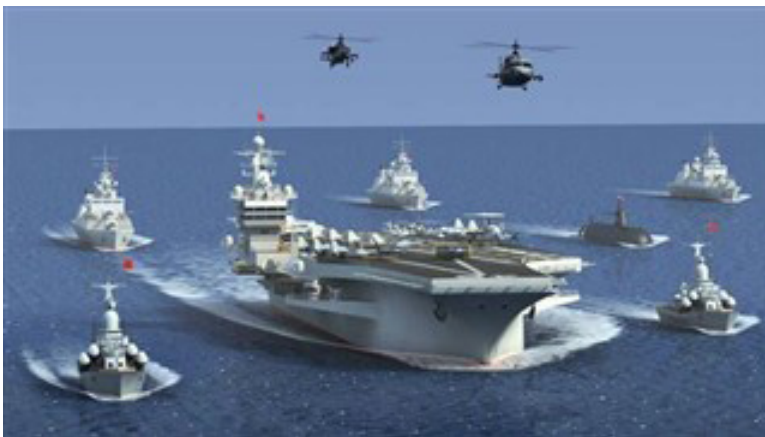
PLAN Exercise East of Taiwan

Domination and Control over the China Seas. During the past three years of military modernisation, the CMC has continued to accord high priority to domination over the South and East China Seas – the Taiwan and the Sea of Japan region. Accordingly, the PLA Navy (PLAN) and the PLA Air Force (PLAAF) have been tasked with exercising what is termed as 'routine control' by regular sailing and flying combat sorties over these waters and the islands therein. Enforcement of the East China Sea Air Defence Identification Zone (ADIZ) has also been an objective with the purpose of consolidating China's control over that region in defiance of the rest of the international stake holders backed up by strong US military presence.