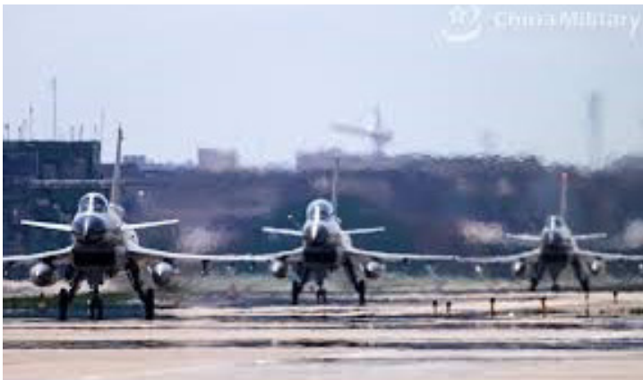
PLAF Drill