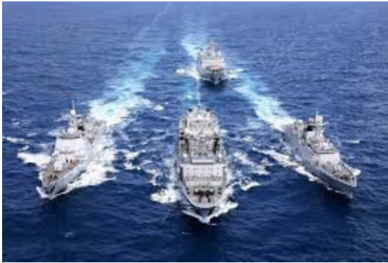
PLAN Manoeuvres in South China Sea (chinadaily.com.cn)

Build-up of Air Capability. Notable progress made on PLAAF modernisation schemes are as follows:-