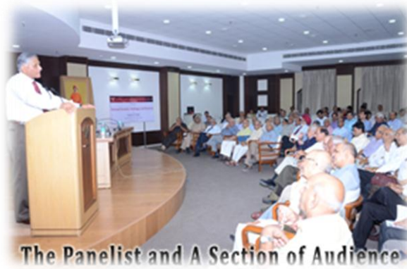
The Panelist and A Section of Audience

Gen. VK Singh's talk was well received by the audience and