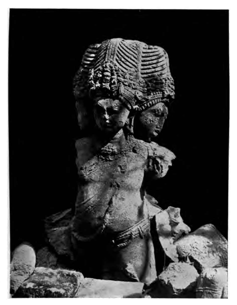
Brahmā. Brahmanical stone sculpture, Elephanta, 8th Century.