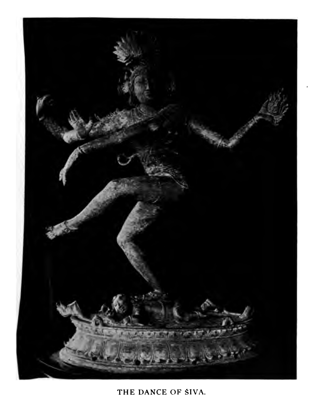
Cosmic Dance of Națarăjă. Brahmanical bronze. South Indian. 12th Century, Madras Museum.